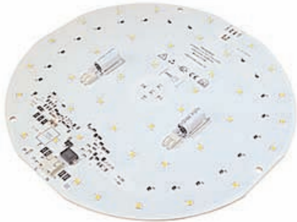
CLE-AC-160 - Standard