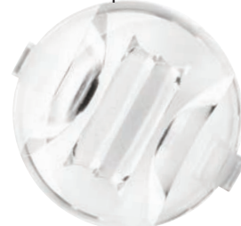
Escape Route (E)

Comes complete with 3 clip-on heads to choose from.