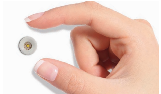
The XY-Fi indicates green to show 'mains healthy' and switches to full output of white light when in emergency mode.

WATTAGE 3 Watts DRIVE CURRENT 275mA LUMEN OUTPUT 77 (Typical) CONDUCTORS AWG28 (0.08mm 2 ) WIRE LOOM 3mm outer diameter DIMENSIONS 26mm x 12mm Ø 10mm Ø mounting hole WEIGHT 20g