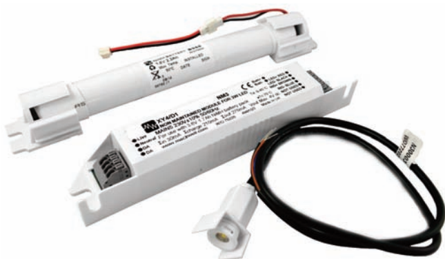
Order Code 9005028

ELECTRICAL TESTING STANDARDS EN 62031 EN 62471