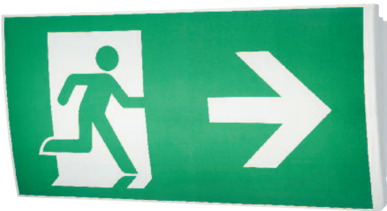
ISO sign format