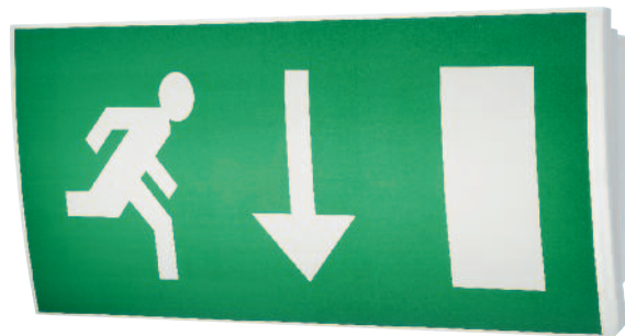
EC Signs Directive format